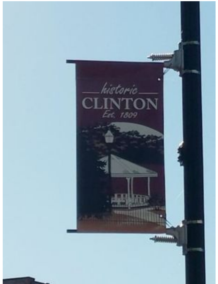
3. Downtown Clinton