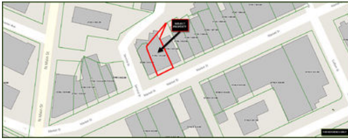
4. Tax Map