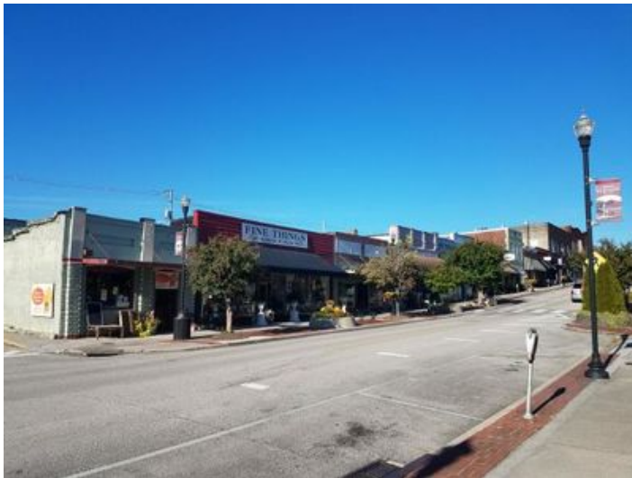
2. Downtown Clinton