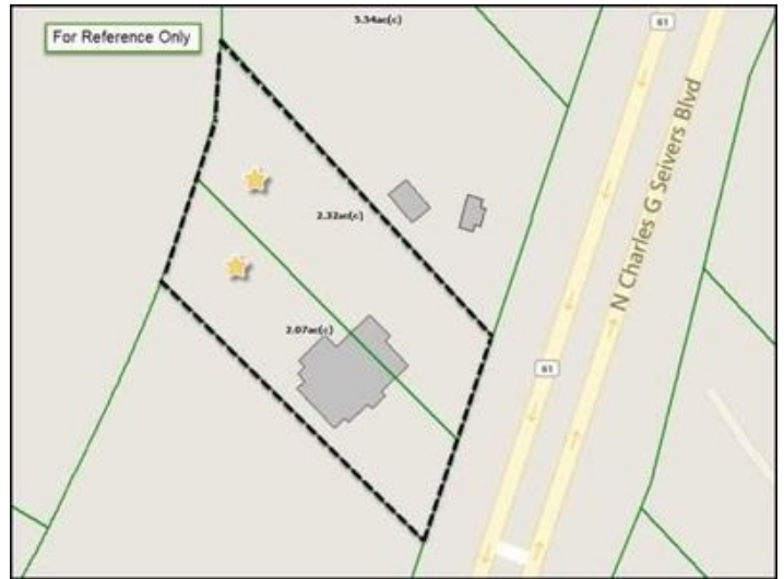
4 Tax Map