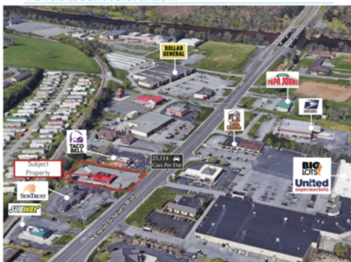
bird's eye aerial

1112 N Charles G Seivers Blvd | Clinton, TN