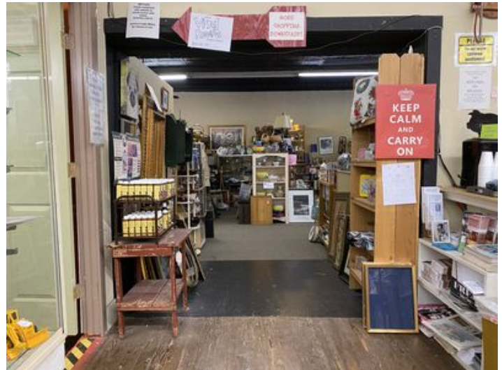
Walk-through to 337 (red building)