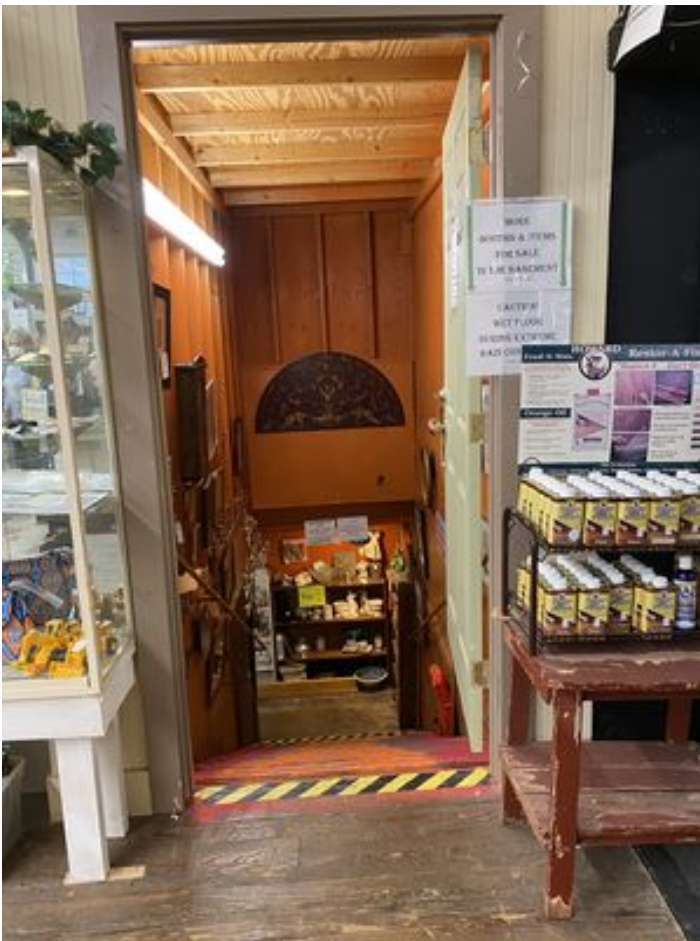
Stairway to basement/personal garage