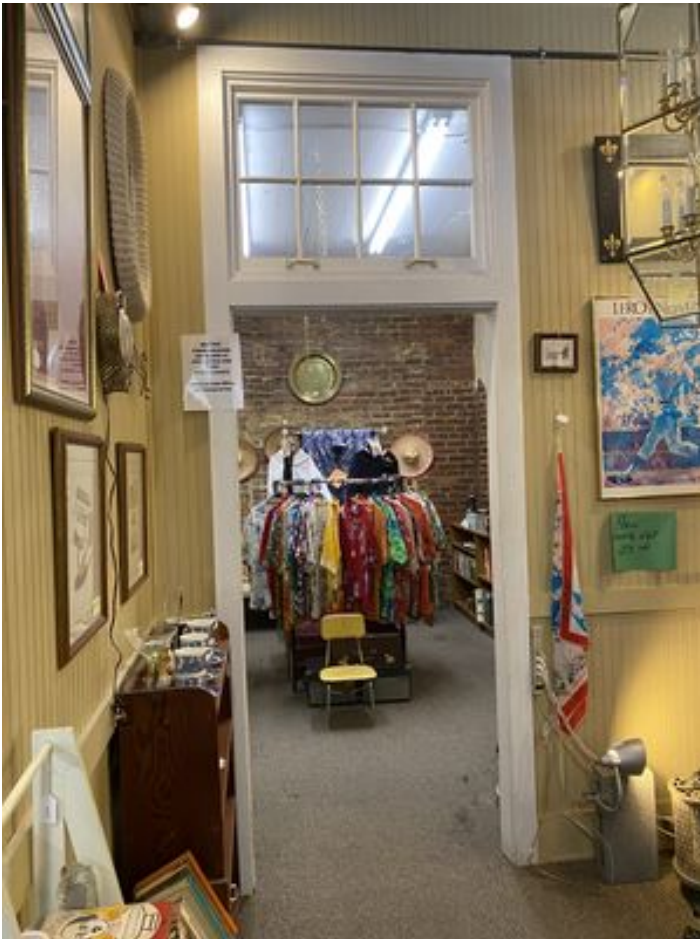
Rear of 337—could be offices