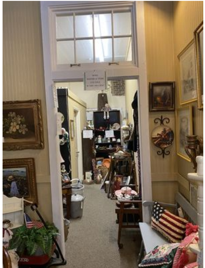
Rear of 337—could be offices